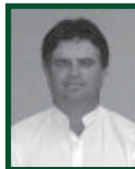
Emile Cordaro Chairman Energy Council American Electric Power